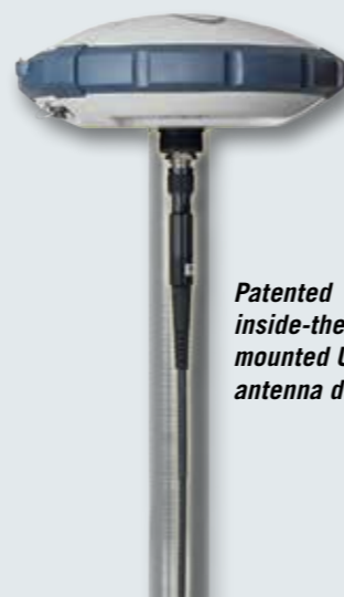
Patented inside-the-rod mounted UHF antenna design